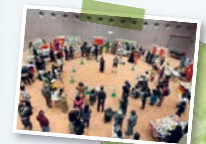
※KIA Festival 2020