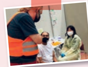
※Foreign Resident Vaccine Day Event