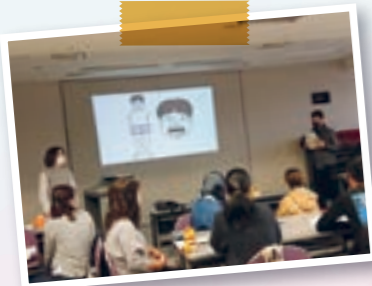
※Japanese Language Class