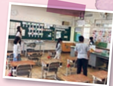
※Japanese Language Learning Class (FUTURO)